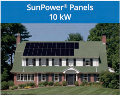
More Energy In Less Space

What are the most important aspects of an excellent solar experience?